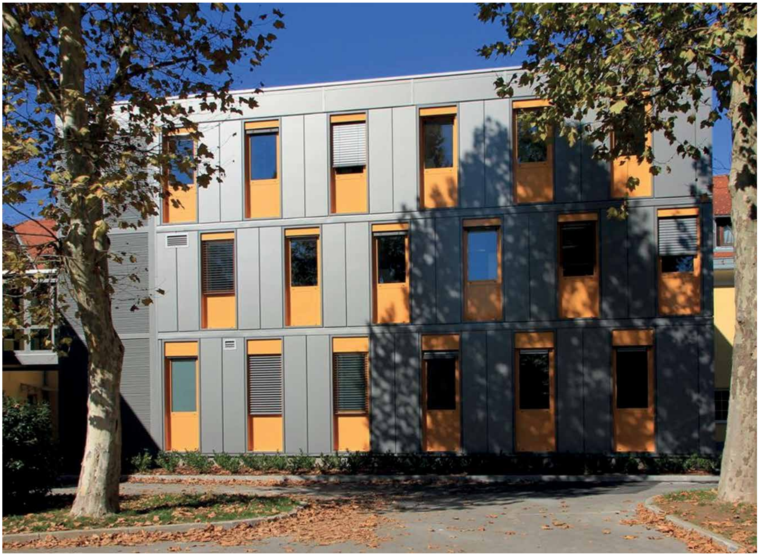
Construction featuring 21 Trimo MSS modular units, 2010